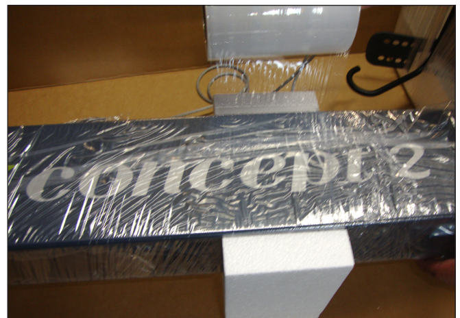
10. Center foam u-block under the return mechanism box under the letters "ep" of the Concept2 logo.