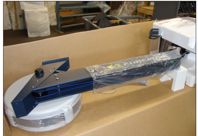
8. Position the flywheel return assembly so that the flywheel is facing down.