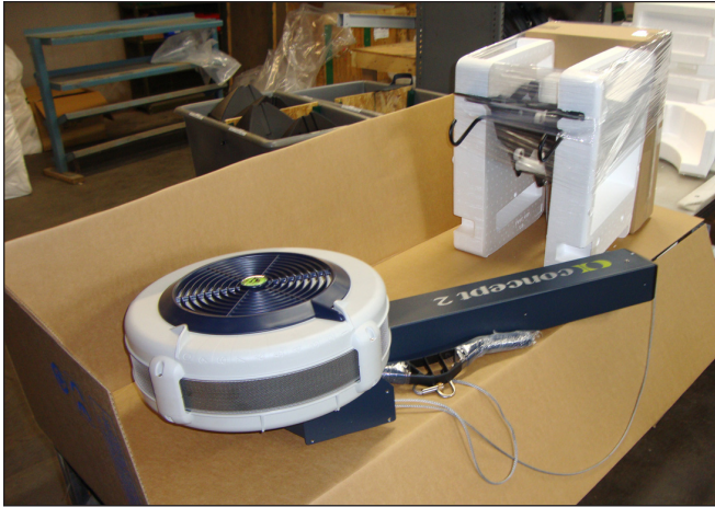
5. Position flywheel return assembly with the flywheel facing up.