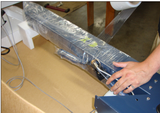
9. Hold handle against top of return mechanism box and wrap with stretch wrap.