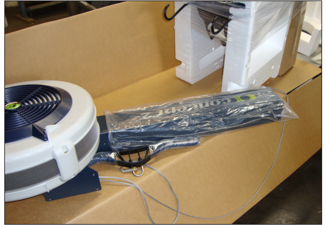
6. Protect assembly box arm and handle by wrapping them with stretch wrap.