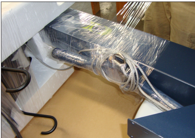
13. Coil drive cord and wrap against return mechanism frame.