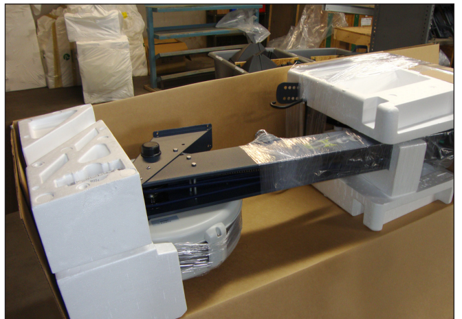
14. Add top foam cross-block.