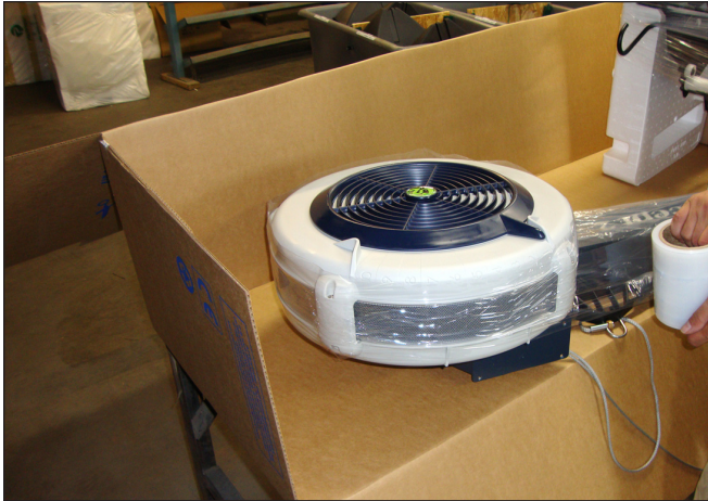
7. Wrap flywheel with stretch wrap. Three wraps is sufficient.