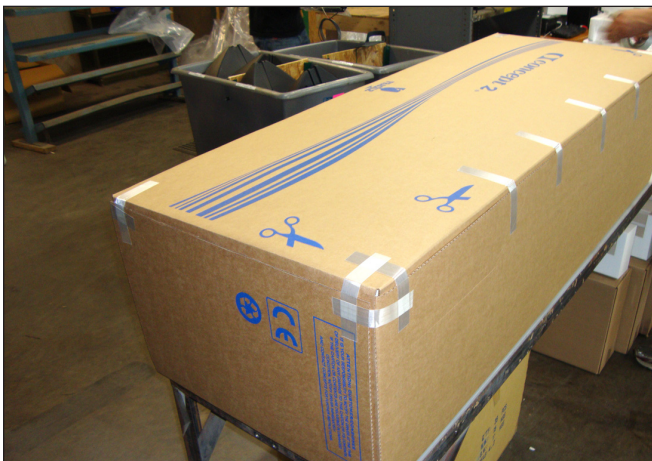
15. Tape box.