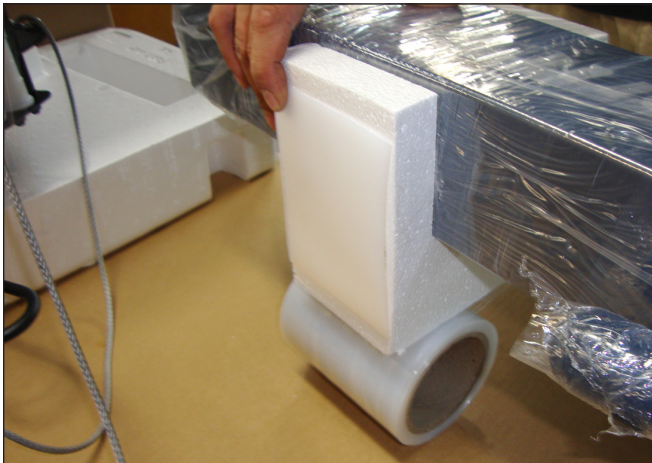
11. Place foam u-block with plastic protector at end of return mechanism box and wrap all with stretch wrap.